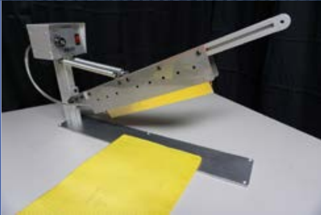
Model above: RX-84-BAO-RK 13" (330mm) Heavy-duty Brass Hot Knife