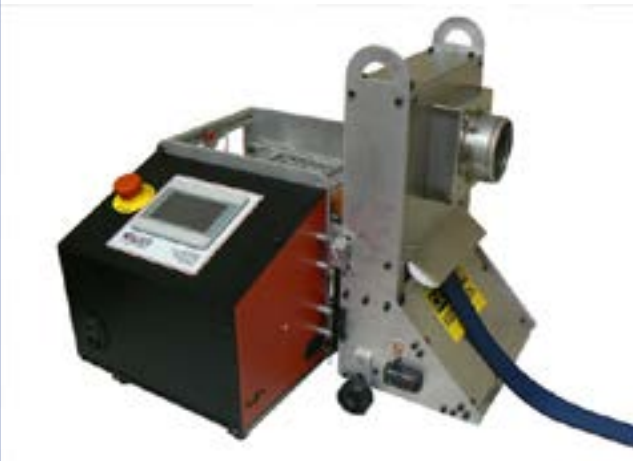
Model shown: RX-240-SCL-DEK 5" (130mm) Hot Knife